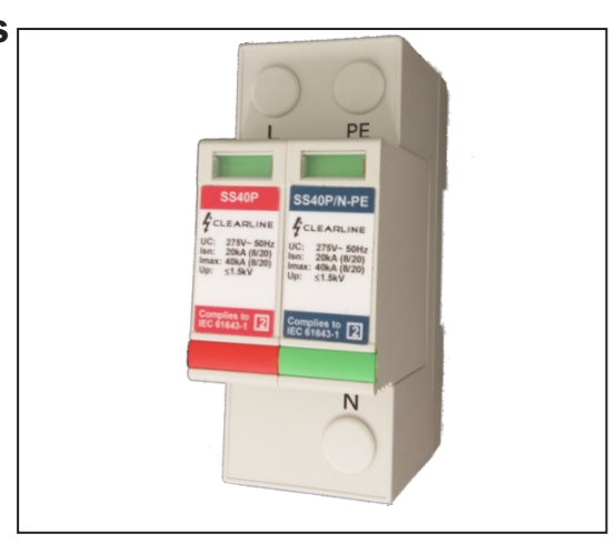
*Specifications subject to change without prior notice due to continuous improvements

A compact surge arrester for single-phase installations. A potential equalisation gap device has been included for neutral/PE connection to comply with the requirements of SABS/IEC 61312-1. Remote signalling contacts have been included.