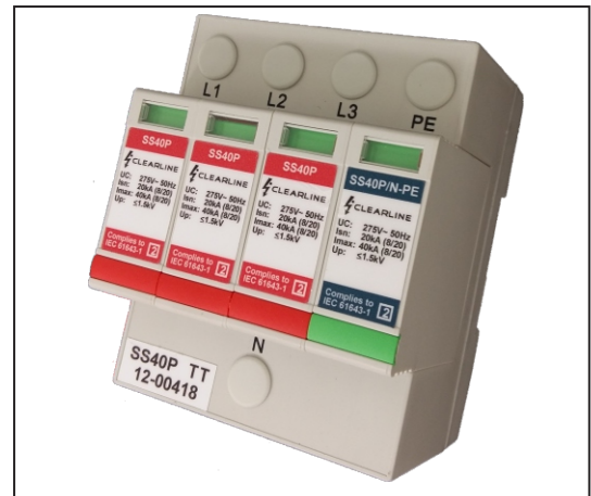
*Specifications subject to change without prior notice due to continuous improvements

A compact surge arrester for three-phase installations. A potential equalisation gap device has been included for neutral/PE connection to comply with the requirements of SABS/IEC 61312-1. Remote signalling contacts have been included.